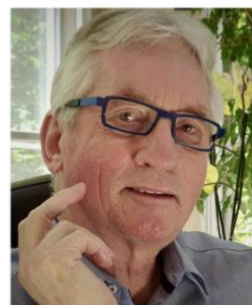
Dr. Frans de Waal World-renowned primatologist and author, named one of the 100 Most Influential People Today by Time Magazine